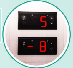
EASY TO READ DISPLAYS