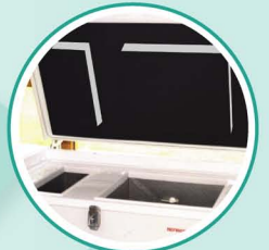
TWO SEPERATE COMPARTMENTS