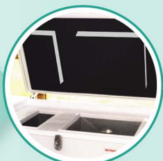
TWO SEPERATE COMPARTMENTS