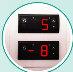
EASY TO READ DISPLAYS